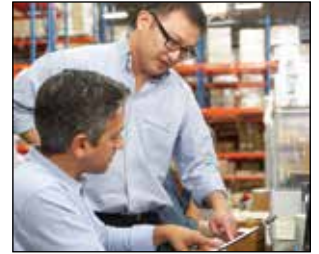
Custom financing packages