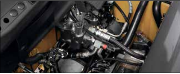
Factory warranty for added protection