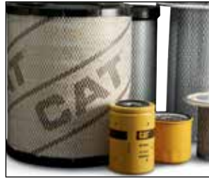
Genuine OEM parts