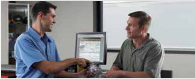
Local service and support