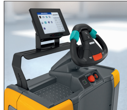
Customizable accessories to meet your application needs