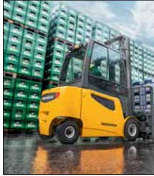
Smooth ride in outdoor applications