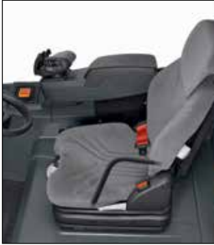
Ergonomic operator compartment