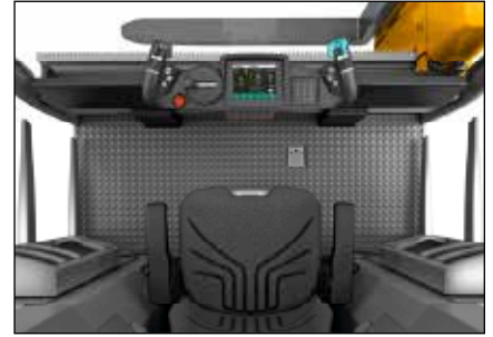
Center operation control (standard on all EKX 4 and 5 series configurations)