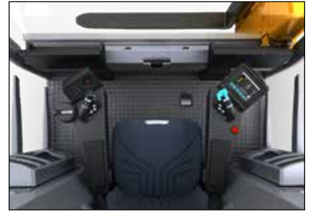
Split operation control (optional on all EKX 4 and 5 series configuration, but not compatible with freezer package on any model)