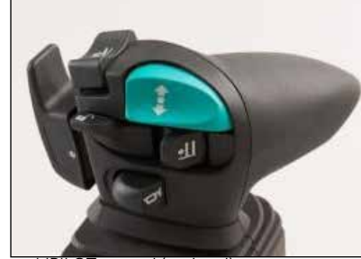
multiPILOT control (optional

• Built in compliance with ANSI/ITSDF B56.1 design specifications in place at time of manufacture.