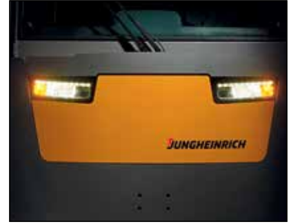
Front lights for increased visibility