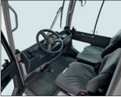
Spacious and comfortable operator compartment