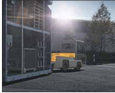
Touch mode makes attaching trailers easy

The standard EZS 7280NA comes equipped to accommodate 620 Ah. For even more capacity, the EZS 7280XL accommodates 775 Ah and 930 Ah.