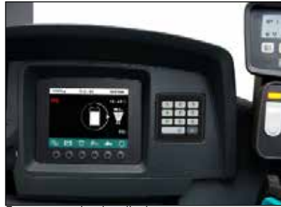
Easy-to-read color display