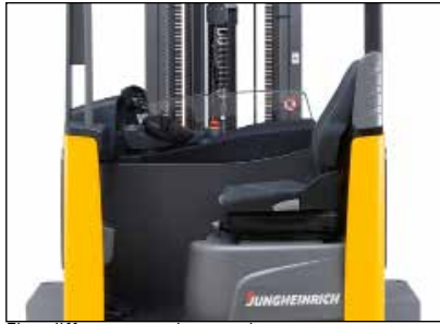
Five different steering modes