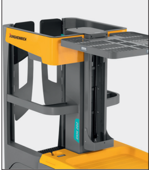
Controls and storage tray in view at all times