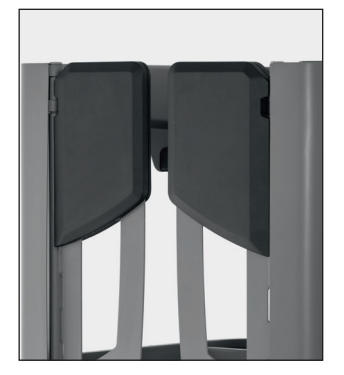
Padded doors for easy entry and operator comfort