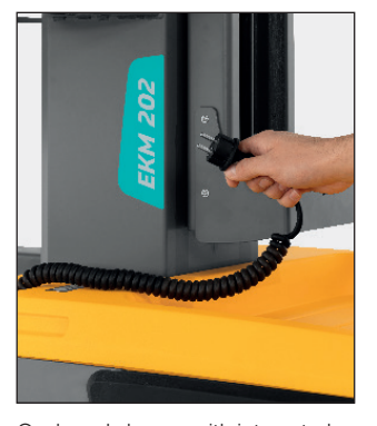
On-board charger with integrated spiral cable