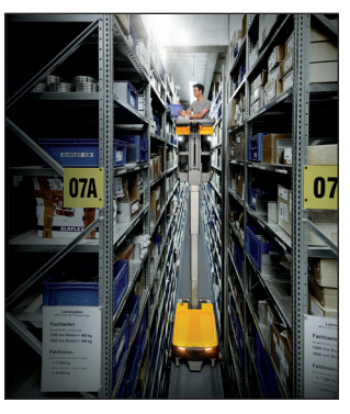
Stable even at full height