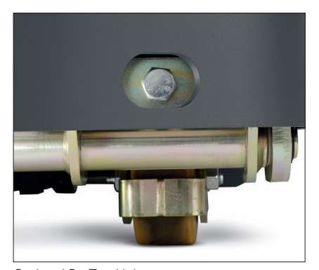
Optional ProTracLink caster